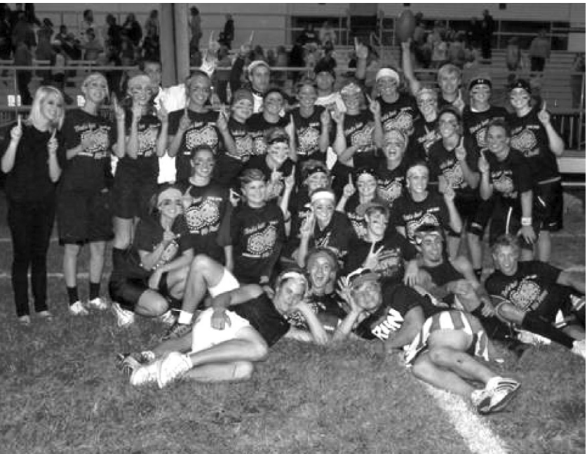
Seniors won the Powder Puff game during Homecoming.